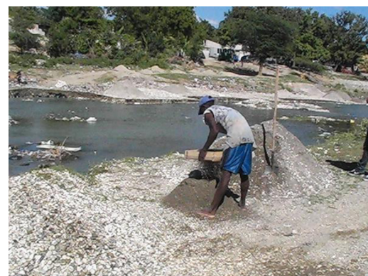
Riviera Grise experiencing artificial channelization as gravel and silt is manually removed.

centers to move to agricultural plains and hills. This will prevent risk of house collapses from land slides. Moreover, translocated people may be provided an opportunity to cultivate land on the plains and hills using proven soil conservation practices contributing to reforestation on the hill slides and improved crop productivity on the plains. This will also lead to improvements in stream quality.