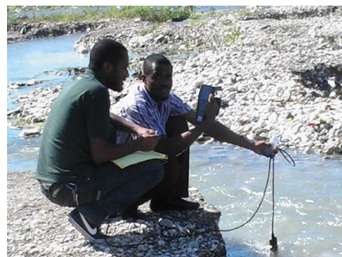
FAMV students using the YSI Pro Plus multiparameter water quality instrument in the Riviera Grise near SUH, FAMV campus. Students monitor basic parameters under the supervision of Dr. Nedunuri.

channelization. The river carries a lot of sediment which is being manually removed from the river bed to the banks to sieve gravel from silt. Local residents collecting the gravel sell it for construction purposes. The river is losing significant substrate at the same time providing livelihood to the poor people who are surviving on the river. There is no riparian